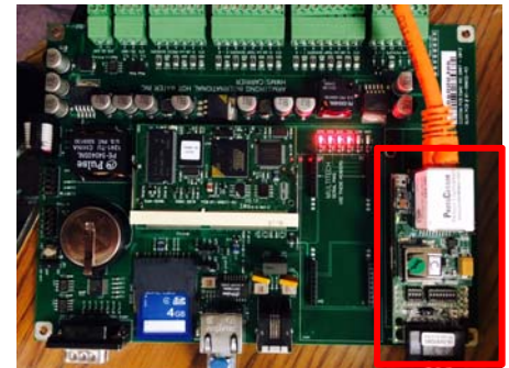
Figure 1: ProtoCessor Module