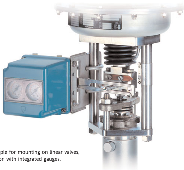
Example for mounting on linear valves, version with integrated gauges.