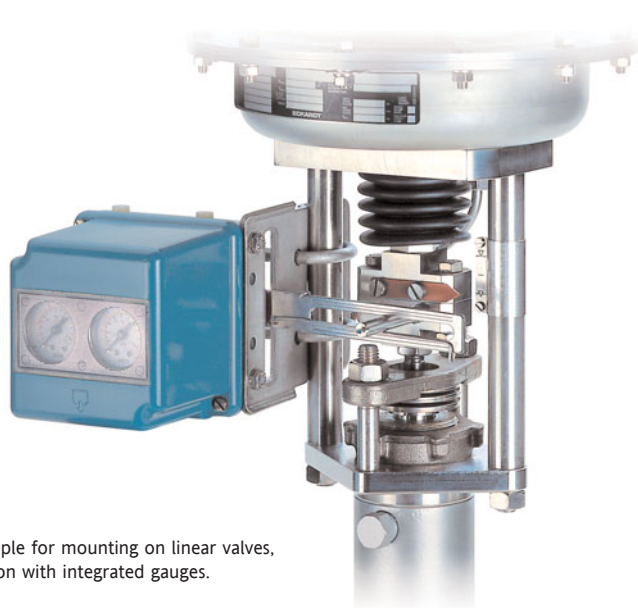
Example for mounting on linear valves, version with integrated gauges.