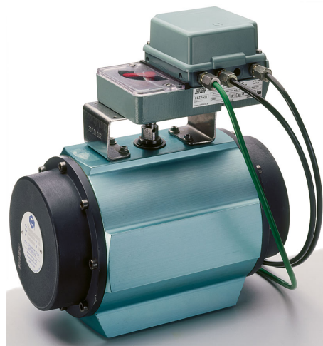
Example for mounting on rotary actuators.