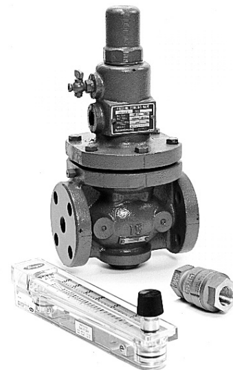
Posi-Pressure Control System Kit, consisting of controller, check valve, airflow meter