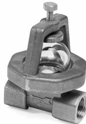
With high-pressure cap